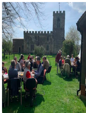
A glorious day for Soup Lunch at St Nicholas

The next Soup Lunch will be Friday 13 May and will be in the village hall as usual from 12.30 to 2pm. Looking forward to seeing you all then.