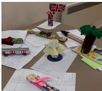
Pictured left, some of the submissions for the WI Smarties Challenge