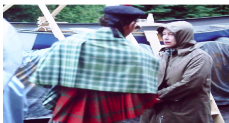
'Queen Elizabeth II talking to King Charles III, Balmoral 1982.'