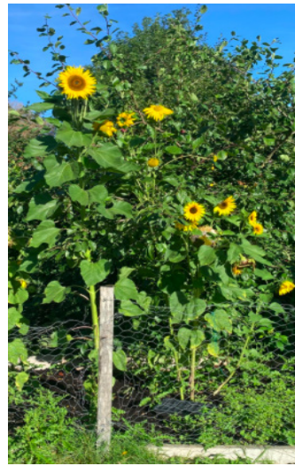
Some tall & bountiful sunflowers, submitted by Graham White.