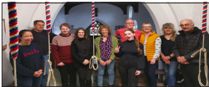
Pictured above, The Bell Ringing Group

This new wave of enthusiasm has inspired the resurrection of the regular 8pm Wednesday practise here in Hinxworth, where we also welcome five learners from Ashwell on a regular basis. There are six bells in St Nicholas' church and the group are working hard to improve their skills. It is great to see such vibrant enthusiasm in the team (pictured below).