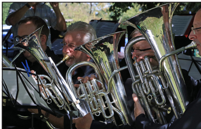
The brass band in full swing.