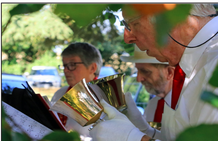
The Bygrave Bell Ringers kept everyone entertained

The event raised £951.60 for Church Funds.