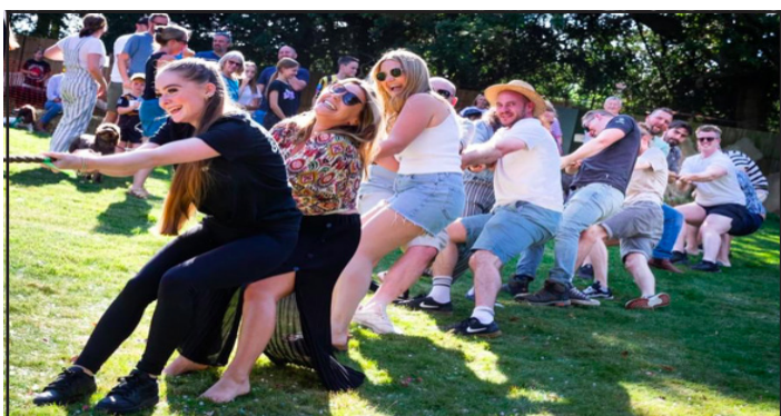
Village Tug of War. Photo taken by Peter Hoskins