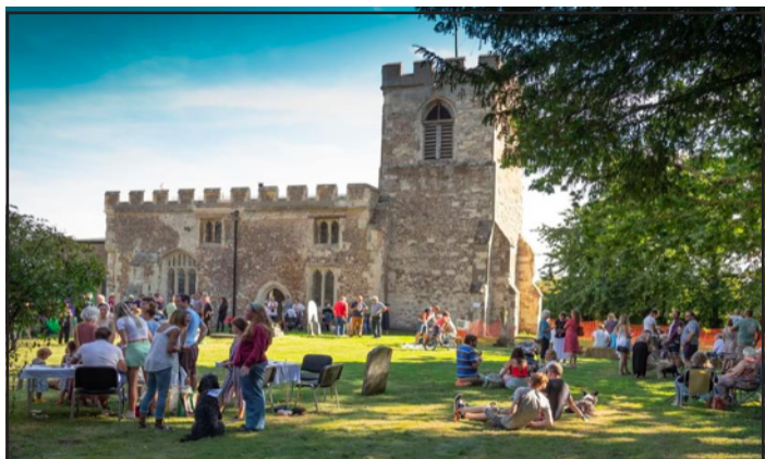
A busy afternoon at St Nicholas'.