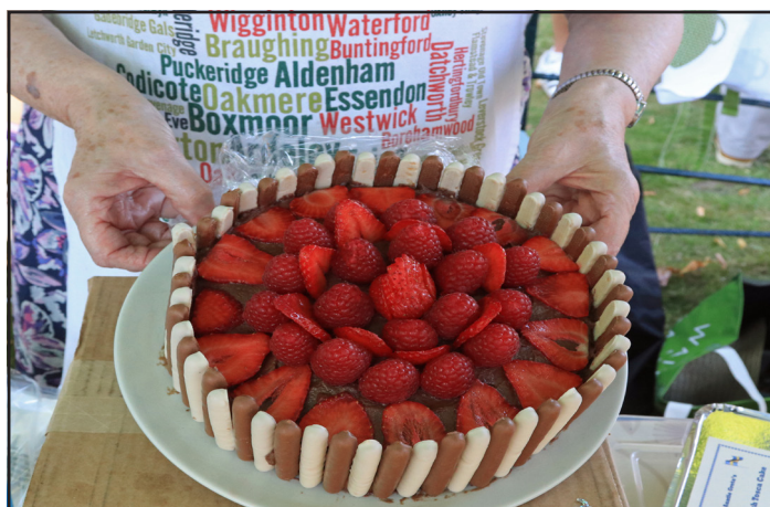
Delicious treats are served!