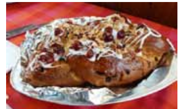
a home-made harvest loaf