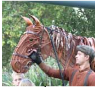
war horse visits IWM