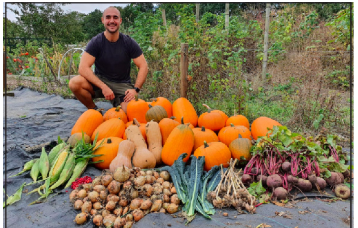
Proudly showing the 'fruits of his labour' from his allotment.