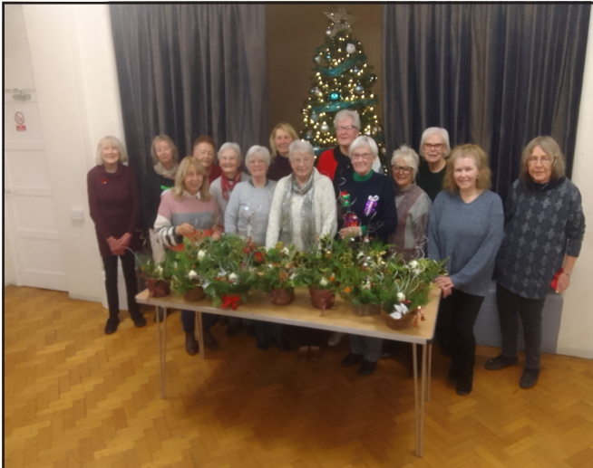
Pictured above, WI members & their 'centre pieces'