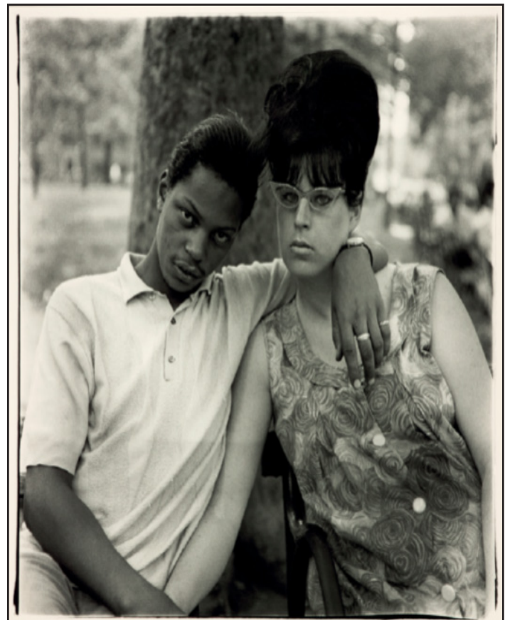
Pictured above, one of the many exhibits on display at North Herts Museum until 25th February 2024.

For more information check out @northhertsmuseum on Facebook and Instagram, @nhertsmuseum on Twitter, visit the North Herts Museum website or call 01462 474554.